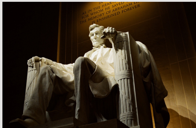
Lincoln Memorial in Washington, D.C.