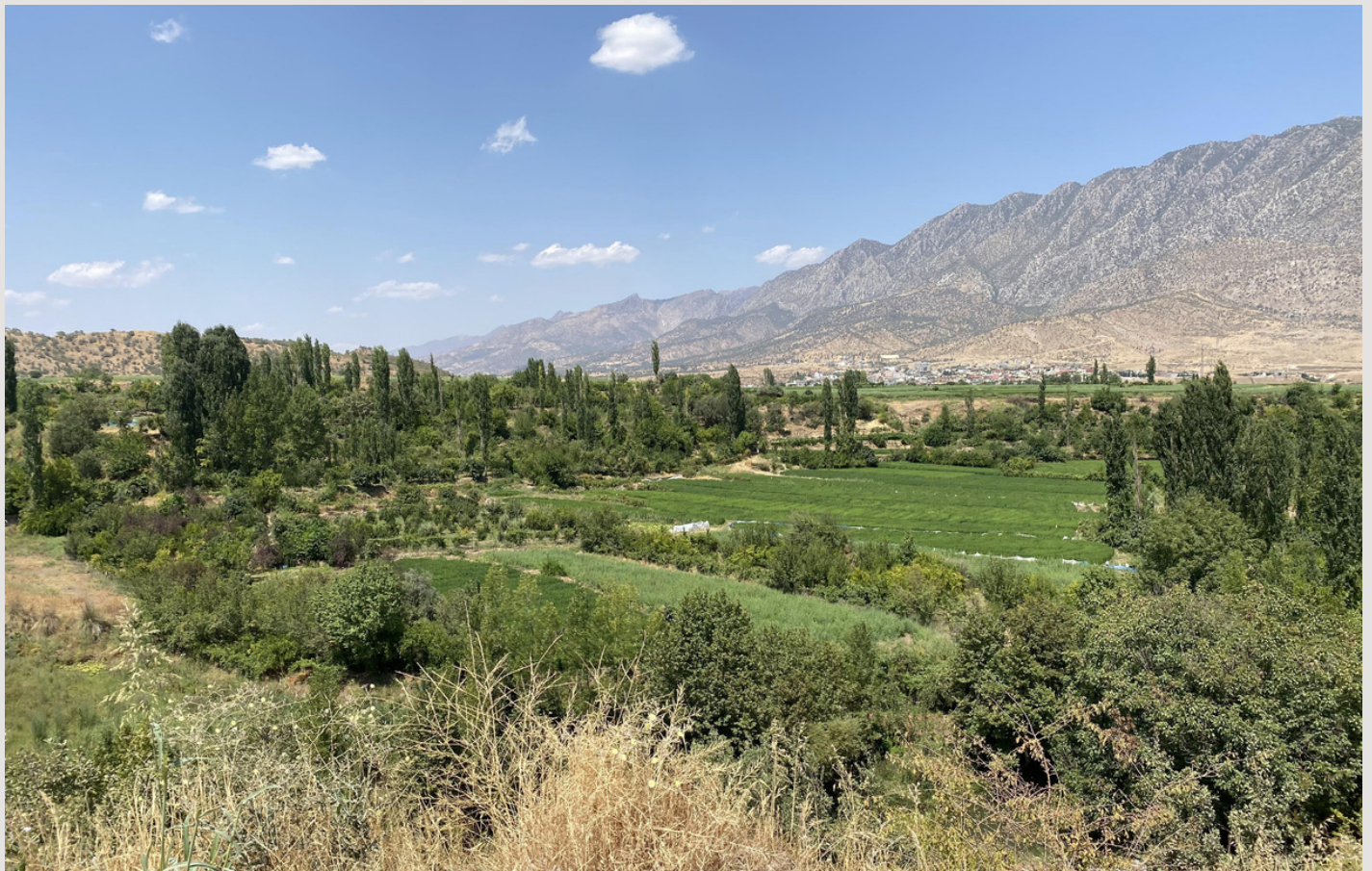
Iraq countryside - Diyala Governorate

Watch the whole video on our website and social media channels soon and stay tuned for future work!