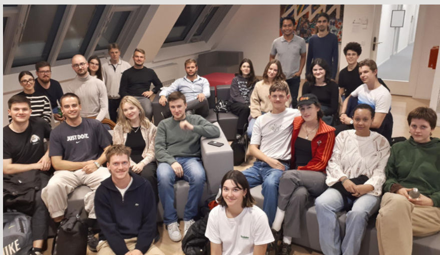
PPP Participants on 2nd November 2023

We were excited to see some old faces from previous events and new attendees not studying at the WU. This means that PPP has increased its popularity beyond the border of the WU Wien! Moreover, the various backgrounds of the attendees contribute to the fruitful discussion about the movie. For example, many students thought “The Lorax” was about aligning business activities with environmental values. In contrast, others believed that “The Lorax” is about the unequal balance of power between the state and the entrepreneur. The group also discussed how these two interests from both parties can be aligned. One of the students pointed out the importance of state regulations to protect the environment, which limits entrepreneurs from being more and more greedy in using resources. Other students thought that the taxes paid by the entrepreneurs should be allocated to help the local people so that they could participate in the economy and replace the damage done by the production process. Meanwhile, others raised the importance of the integrity of the government in implementing the regulations. We concluded that it is crucial to maintain the balance between entrepreneurial activities and the environment, as the market alone cannot fix its externalities.