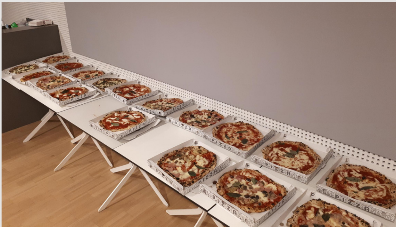
Pizza buffet at the 5th PPP event