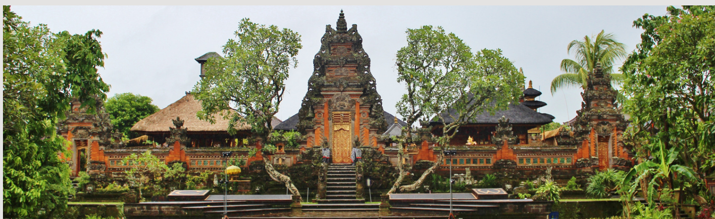
Temple in Bali, Indonesia

As the host country, the government of Indonesia welcomes the facilities enhancement. Indonesia wants to maintain its commitment to a better climate by promoting technology that generates less emissions and supports renewable energy. However, the link between FDI and sustainability does not only come from the government. The interests of consumers and firms can also be a medium influencing FDI to be more sustainable towards environmental conditions. Analyzing the interests of groups in society and their impact on socioeconomic development is something that we do passionately at the Institute of International Political Economy.