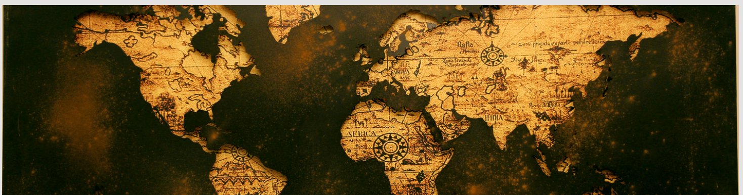
World Map Illustration