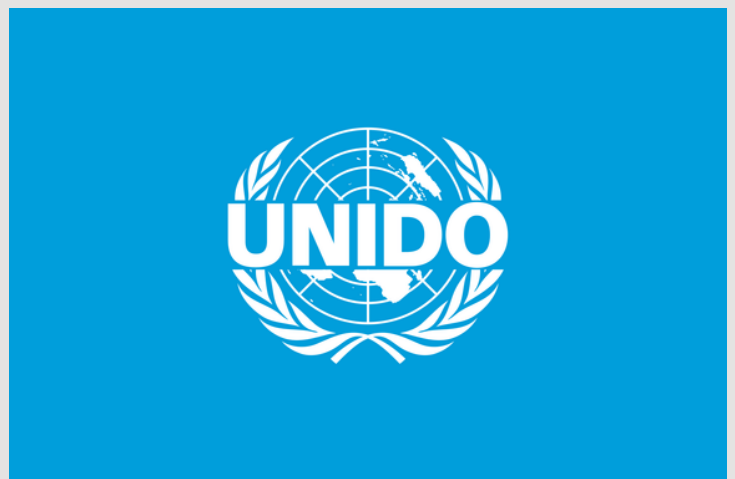
Flag of UNIDO © Public domain