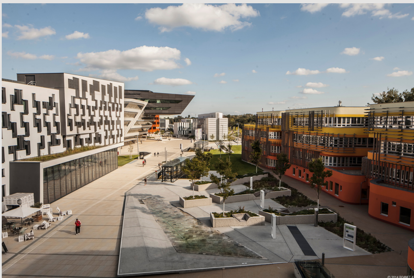
WU Vienna Campus overview

What is more, following my intuition paved the way for a career in economics and allowed me to confidently opt for the "unreasonable" choice and pursue a Ph.D. after finishing graduate school. I have always been fascinated by the interplay of politics and economics. I found the perfect fit for my research interests with the Institute for International Political Economy. This time around, I wasn't deterred by notions of job market prospects of different career choices. As a result, I'm able to pursue my passions, pass on knowledge to students, and think about some of society's most pressing issues!