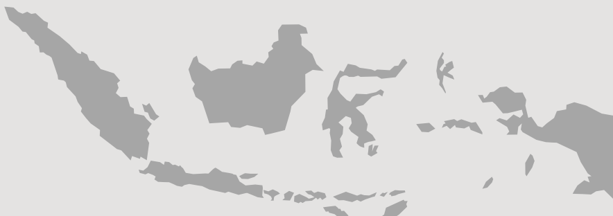
Map of Indonesia - © moarfa23, Faiq Arsa's Images