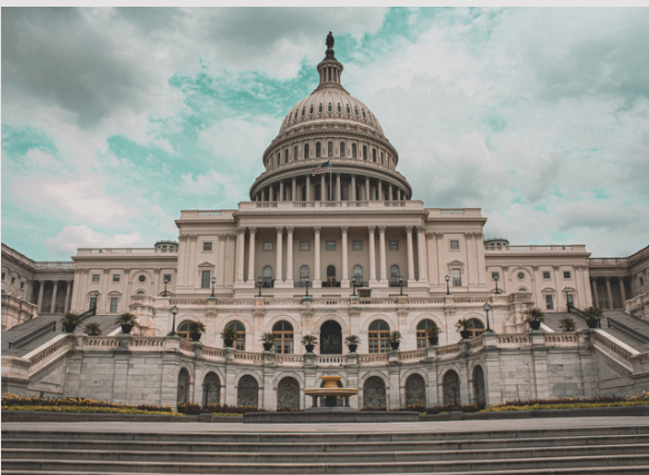
U.S. Capitol in Washington, D.C.