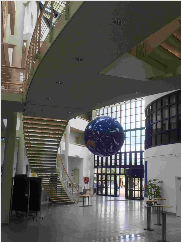
University of Witten/Herdecke