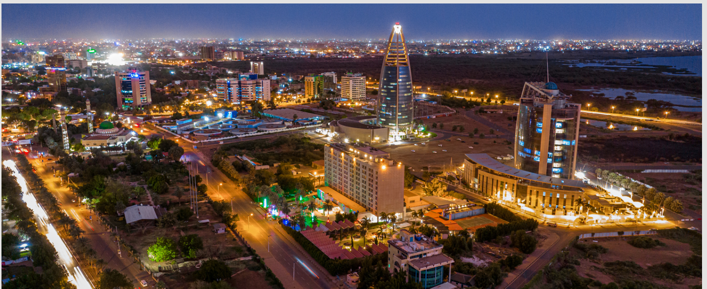
Sudan - Aerial photo of the Sudanese capital Khartoum

We summarized our analysis in a podcast episode. Setting up a podcast is a creative process, so we were willing to invest more time and effort than usual for a conventional presentation. Our group dynamic was also different from our past experiences. Everyone brought forward wonderful ideas, and we genuinely had fun recording our findings. Altogether, this task was a more meaningful experience than conventional group presentations.