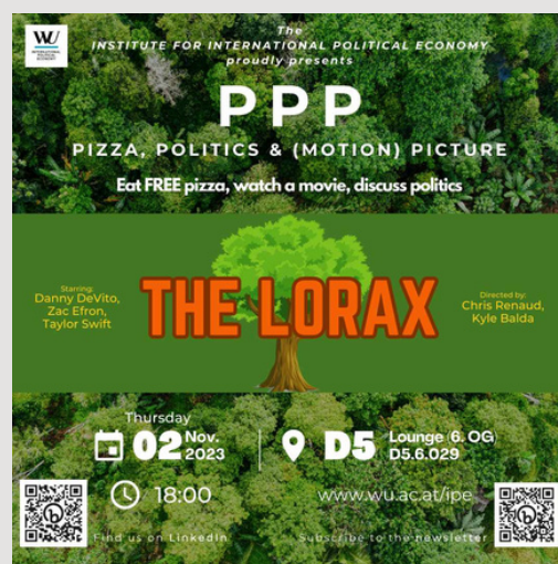
Advertisement for “The Lorax”